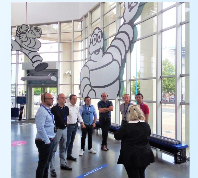
2024 Emerson in Bonneville and 2023 Trelleborg in Clermont Ferrand